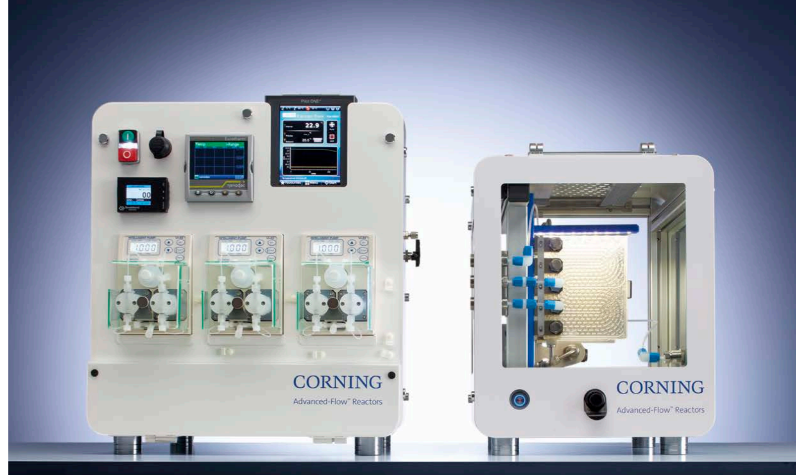
Size: 45 x 48 x 52 cm (L x W x H)