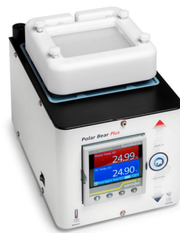
Polar Bear Plus GSM™ reactor