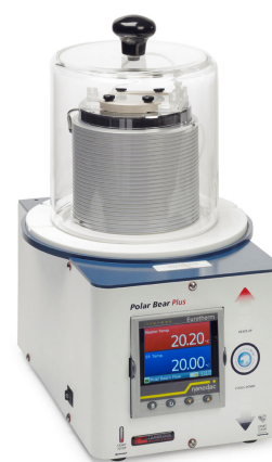
Polar Bear Plus Flow™ reactor

The HotChip and Polar Bear Plus GSM are dedicated plate reactor modules for GSMs — the latter with active heating and cooling control.