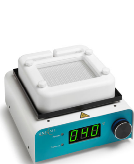
HotChip™ heated GSM reactor

Reactors: Connect up to 4 reactor modules by ethernet and control them using the Binary Pump control software. Currently, available reactors include the HotCoil™ , HotChip™ , Polar Bear Plus Flow™ (cryogenic coil reactor), Polar Bear Plus GSM™ (cryogenic 'chip' reactor). These modules are compatible with all existing Uniqsis coil, and chip (GSM) reactors.