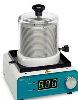
HotCoil™ heated coil reactor