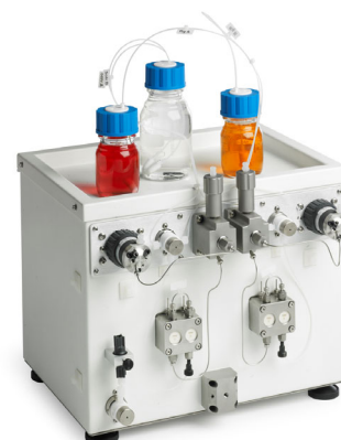
Binary Pump Module

Pumps: At the heart of every FlowLab Plus™ system is the Uniqsis Binary Pump Module™ . This is a dual channel reagent delivery system that incorporates all the necessary pressure sensors, injection loops and valves needed to build a custom flow chemistry reactor system. The BPM is available with 316L stainless steel, Hastelloy C-276, or PTFE acid-resistant flow path versions.